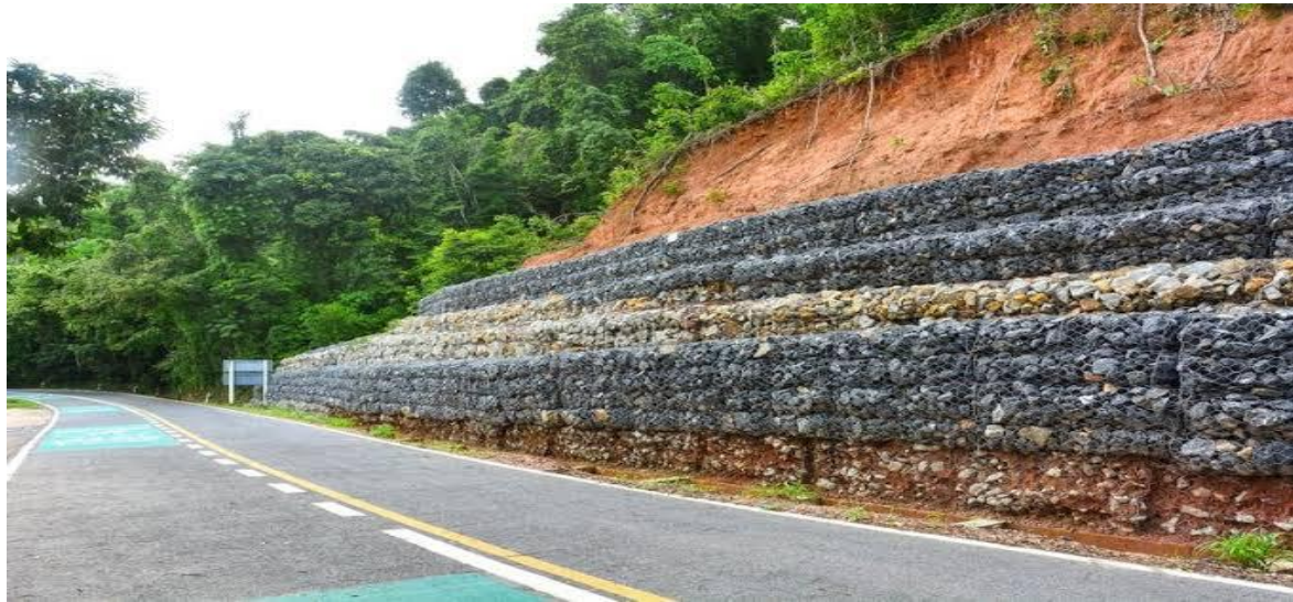
Fig No.2 Landslides Mitigation Slope Protection With Gabion Retaining Wall

Techniques used for early landslide warning are largely phenomenological, relying on surface measurements of displacements over time. Most monitoring is carried out through repeat geodetic surveys of monitoring prisms, which provide precise data on magnitudes and rates of horizontal and vertical ground movements.