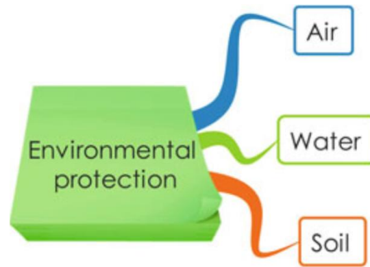
Fig.1 Environmental protections address three main areas: air, water, and soil. Human activities can have an adverse impact on each of them.

The ability to detect the presence of pathogens or toxic agents in air, water, and soil is of great importance for human health and the protection of the environment. Nanotechnology offers the potential for extremely sensitive and fast measurement with sensor equipment which is less bulky, simply to operate, and of low cost.