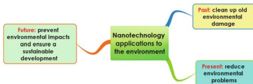
Fig. 2. Schematic representation of the benefits of nanotechnology for the Environment