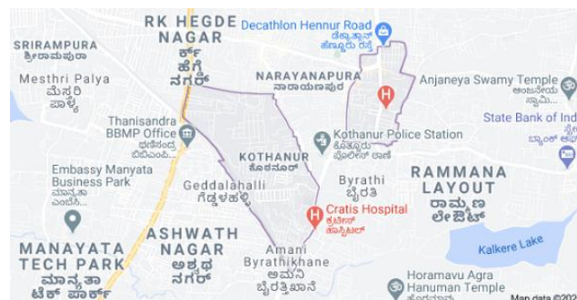
Figure: Kothanur Map

Set apart as one of the quickest developing rural areas of North-Bangalore, Kothanur is a flourishing miniature market enveloping numerous prominent lodging projects. Admittance to Thanisandra Main Road and Hennur-Bagalur Road makes this area exceptionally dynamic for land advancement and venture.