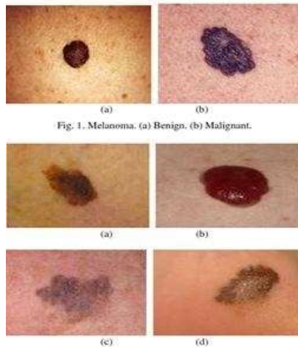
Fig. 1. Melanoma. (a) Benign. (b) Malignant.