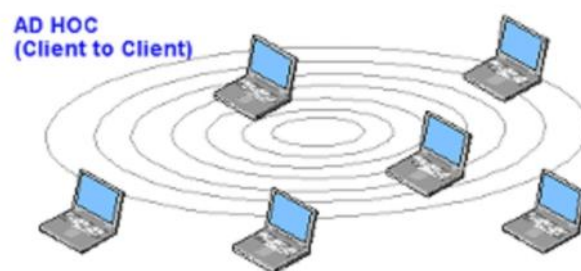
Figure 2: Ad-hoc Network

Second, it is more difficult to control or coordinate proper operation of an ad hoc network, since each wireless host may have its own algorithms to perform activities such as time synchronization, power management, and packet scheduling. In an infrastructure network, these algorithms are often implemented in and thus harmonized by the base stations or access points.