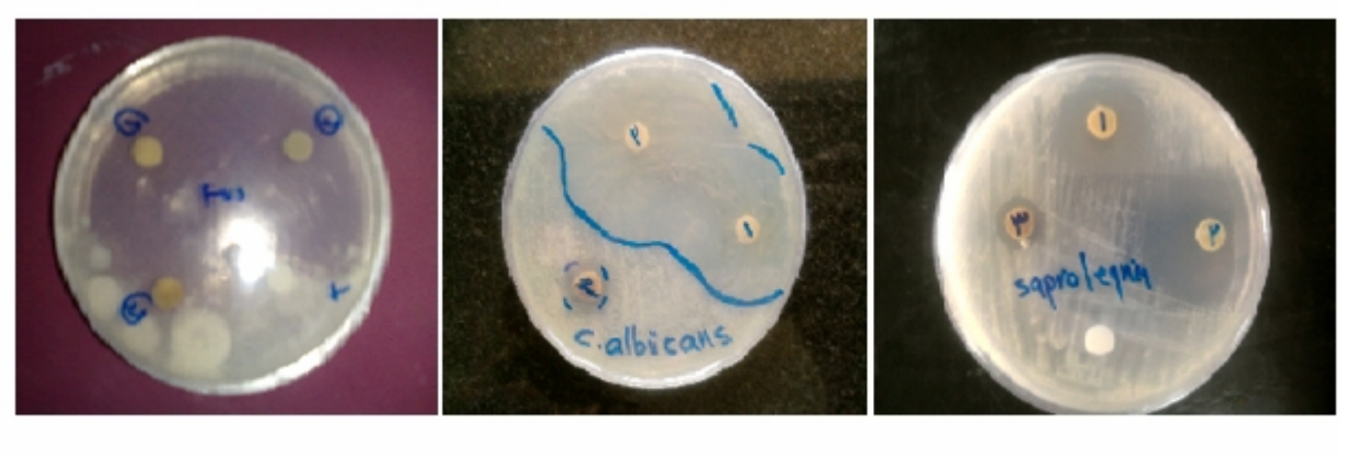
Fig. 2: Inhibitory zones of alkaloid compounds.A: Fusarium sp. B: Candida albicans , C: Saprolegnia sp.

16mm, 16.6mm, and 17mm had the lowest sensitivity towards alkaloid compounds and Fusarium solani, Candida albicans, and Saprolegnia sp. With average halos of 21mm, 20mm, and 19.66mm had the highest sensitivity towards alkaloid compounds. Fig. 2 depicts some of the fungal inhibition zones of the extracts.