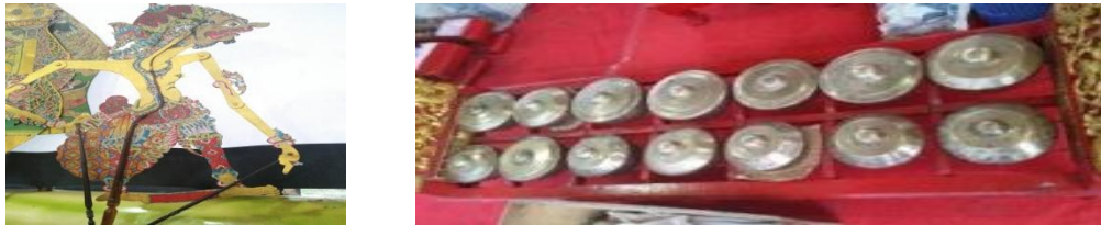
Figure 1. Bonang

Peirce refers to a 'genuine relation' between the 'sign' and the object which does not depend purely on 'the interpreting mind' (ibid., 2.92, 298). Index is a sign which refers to the object that it denotes by virtue of being really affected by that object (Winckler, 2011: 78).