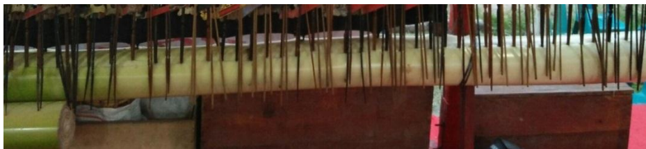
(pic. 45 : dhebog )

According to Peirce in Chandler (2007: 38) symbols are based purely on conventional association. Symbol is the signifier (the physical/material) does not resemble the signified (concept) so the relationship between the two must be taught. The example of this is the using of gedebog (banana tree trunk), which symbolizes the earth as a place of human lives.