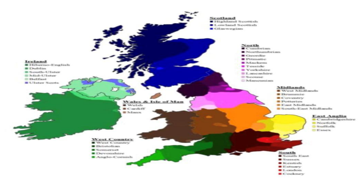
Figure 1: British and Irish Dialects.

These figures give rise to an important query, i.e. are these different dialects understood among people from these regions?