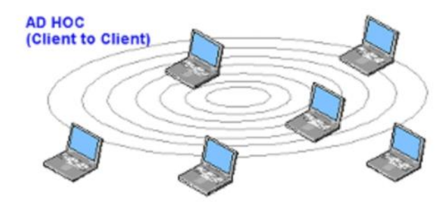
Figure 2: Ad-hoc Network

Second, it is more difficult to control or coordinate proper operation of an ad hoc network, since each wireless host may have its own algorithms to perform activities such as time synchronization, power management, and packet scheduling. In an infra structured network, these algorithms are often implemented in and thus harmonized by the base stations or access points.