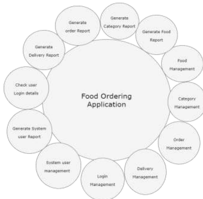
Fig .2 DFD Level 1