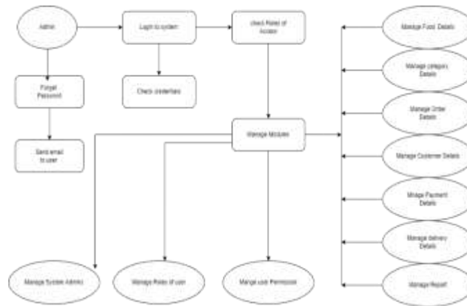
Fig. 3 DFD Level 2